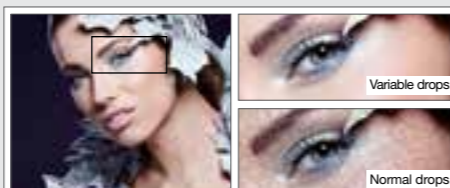
4 pl variable drops make difference. Excellent gradation and hypochromic effect.

Variable drops function provides 3 different drop sizes at once. The minimum size is amazingly 4 picolitre and ensures a photographic type image offering smooth gradation patterns and brilliant transitions of many colour layers even in the 4-colour mode.